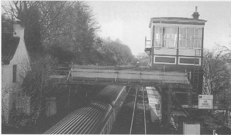
Work in progress on renovating the distinctive bridge cabin signal box at Wylam Station. An important feature of the village's railway heritage, the work was funded by the Railway Heritage Trust. The signal box was constructed by the NER in 1897.

How much will all this cost? Well, a far cry from the £10,000 needed to enlarge the area in 1990. The total cost of the project is £46,000! We already have £12,000 promised from the Parish and Tyndale Councils and our own savings.