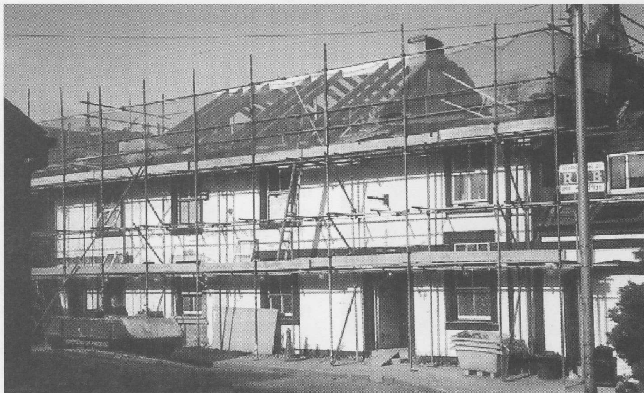
Compare this picture taken several months ago while work was in progress on modernising the Black Bull Inn, with the impressive completed premises which you can now see - and enjoy using - on the Main Street.