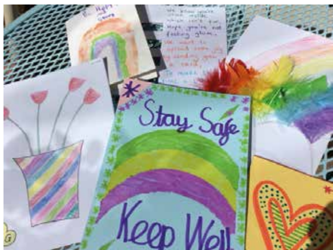
Cards from the Brownies