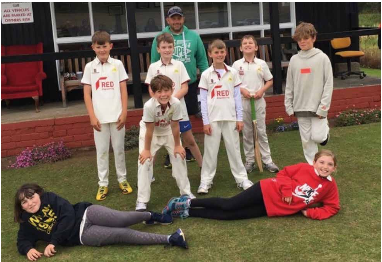
Wylam U11s cricket team